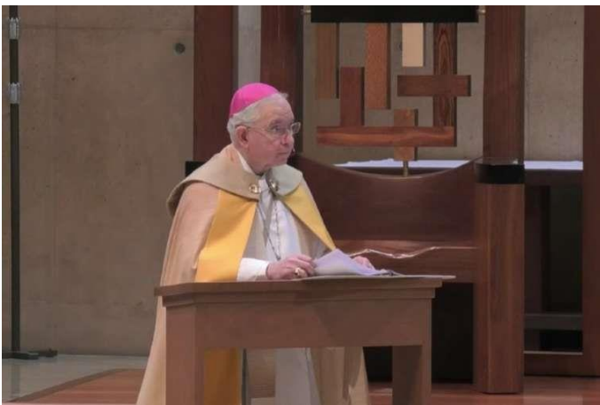
Archbishop Jose Gomes of Los Angeles leads the reconsecration of the country to Mary on May 1, 2020.

Washington, D.C. Newsroom, May 1, 2020 / 02:00 pm MT ( CNA ).- Dioceses across the United States and Canada joined together on May 1 to reconsecrate themselves to the Blessed Virgin Mary in an act of united prayer for delivery from the coronavirus pandemic. Archbishop Jose Gomez of Los Angeles, president of the United States Conference of